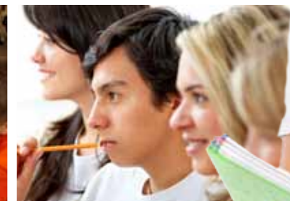
*Comments from Lisbon CSD Staff

OUR MISSION: TO ENSURE SUCCESS FOR ALL LEARNERS.