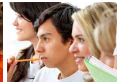
*Comments from Alburnett CSD Staff

OUR MISSION: TO ENSURE SUCCESS FOR ALL LEARNERS.