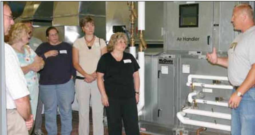
Educators in the Career Awareness class toured the Plumbers and Pipefitters Training Facility in Cedar Rapids during June 2007.