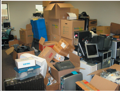
Tech Support Office at 33rd Avenue